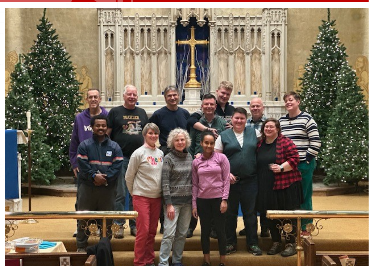
Above: An auspicious crew helped to put up the trees for Christmas at SPR, complete with wine, cheese, and a duet rendition of "Sleigh Ride." Thanks to all who helped!

The Spectrum items, articles and columns need to be to the Parish Office by the 12th of the month. The Spectrum goes to print on the 15th and this date is hard and fast. Articles received after the 12th may or may not be included.